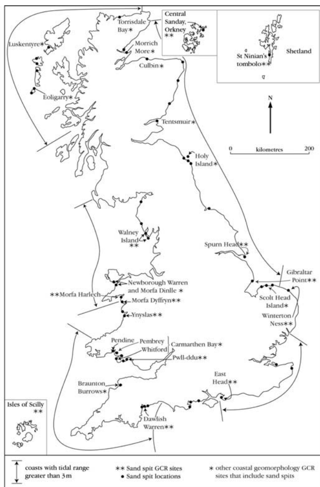
Figure 8.2: The location of sand spits in Great Britain, also indicating other coastal geomorphology GCR sites that contain sand spits in the assemblage. (Modified after Pethick, 1984).