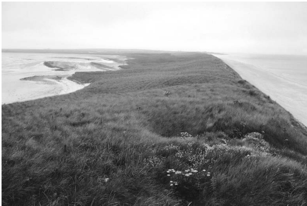
Figure 8.28: Looking north-east along the dune-capped tombolo in the Bay of Newark. Older intertidal gravel ridges can be seen extending inland towards the north in Cata Sand.